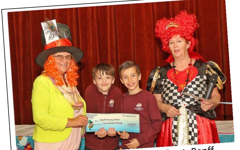
The event raised money for HomeStart, Banff Primary library and the Banff Academy Tanzania trip.

Volunteers and attendees alike had great fun dressing up in special costumes or strutting their stuff in some very mad hats! Cheques for £200 were presented to each of the nominated charities. Money raised from ticket sales was supplemented by a well-supported raffle; thank you to all the individuals and organisations in the community who donated prizes.