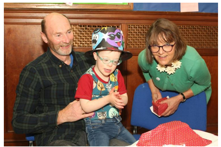
Prizes were awarded each day for the best hat and the best costume.

Volunteers and attendees alike had great fun dressing up in special costumes or strutting their stuff in some very mad hats! Cheques for £200 were presented to each of the nominated charities. Money raised from ticket sales was supplemented by a well-supported raffle; thank you to all the individuals and organisations in the community who donated prizes.