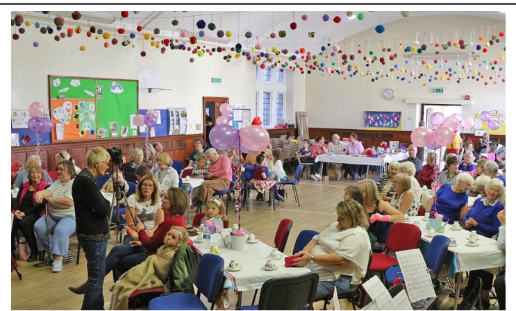
The hall was buzzing, and don't the pom-poms look great!