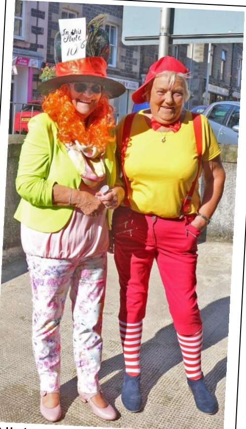
All dressed up in their Sunday best: what people will wear to church these days!

Months of preparation finally ended when the Alice and her friends arrived for the Mad Hatter's Tea Party in Banff Church Hall on 20th and 21st September. Great fun was had by all, singing and dancing along to the show then munching on special Wonderland treats.