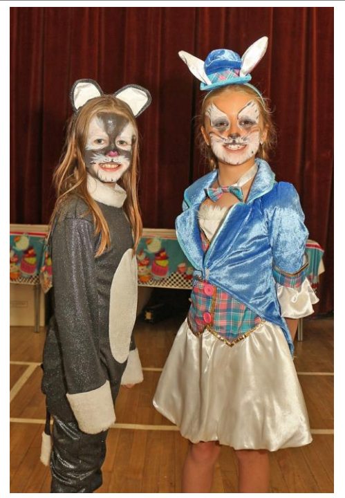
Smiles of relief once it was all over!