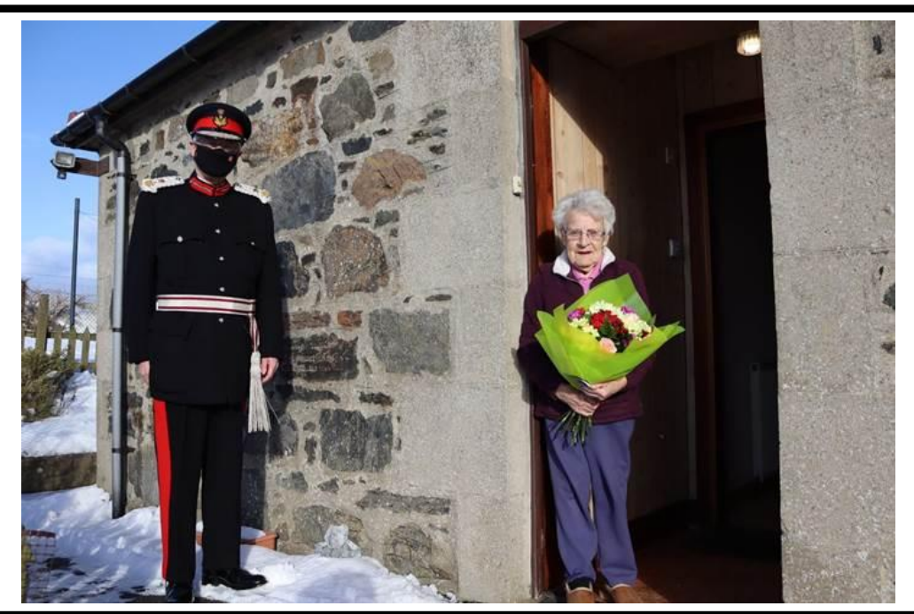
Banff & King Edward Parish Churches www.banffparishchurchofscotland.co.uk