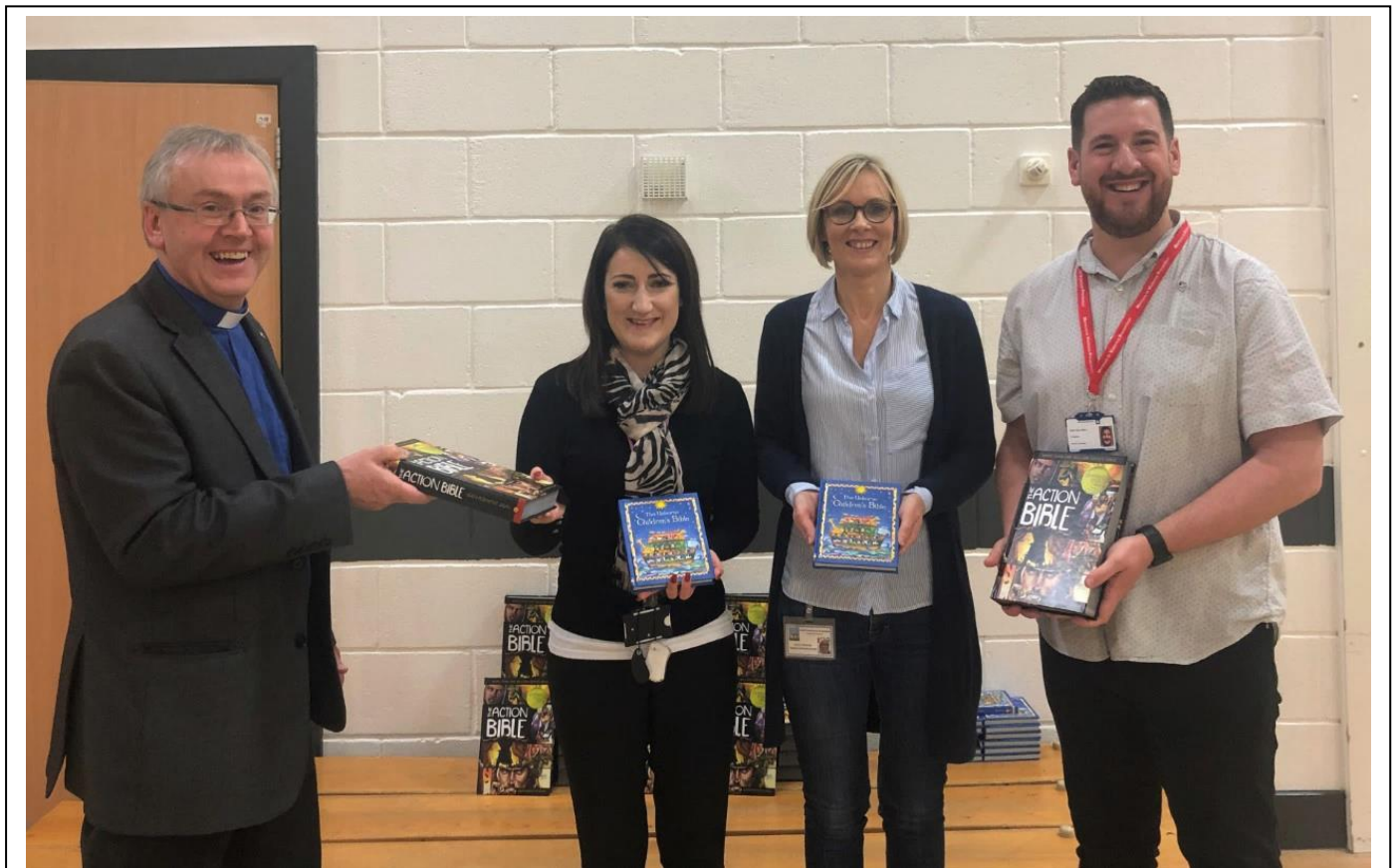
Banff Parish Church and River Church were delighted to present Action Bibles and Usborne Children's Bibles to Banff Primary at a recent assembly.

The museum is currently open from 10.30am until 1.00pm every Saturday. Look out for longer opening hours during the summer.