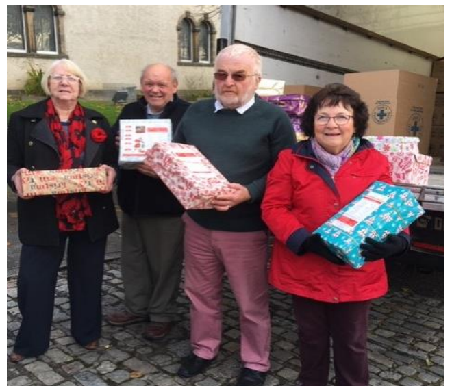
Santa's little helpers: our volunteers help pack the Blythswood shoe boxes into the back of the lorry.

Don't forget to check FaceBook for up-to-date information about all that's happening in the church over the festive period!