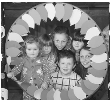
CIRCUS CLUB—SUMMER 2017

working, which develop the life and mission of the local church, and are transformative for both communities and congregations.